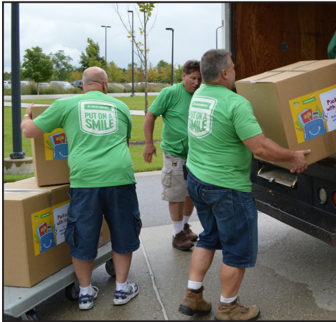
A new record: Delta Dental of Michigan employees broke the record they set last year, contributing more than 800 fully loaded backpacks. Above, the “Put On A Smile” team loads boxes full of backpacks into a truck for distribution. The backpacks filled a conference room, below, at Delta’s Okemos office.