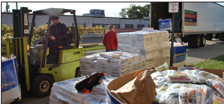
Pallets of help: Kroger stores throughout Michigan offered affordable school supply kits for shoppers to contribute. And they did so by the truckload, with distribution help from our partners at Operation Kid Equip.

347 boxes/bags of supplies 7,000-plus school kits from Kroger shoppers $1,348.94 in donations