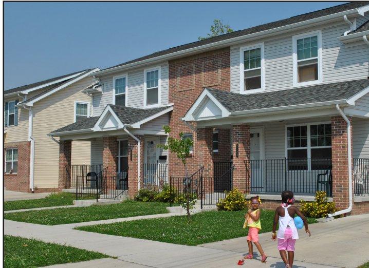
Sunny side of the street: Children play in front of the apartments and townhouses of the Gray Street neighborhood during a recent Volunteers of America Michigan open house.

She didn't win anything. In fact, while driving home, she was pulled over and spent a couple of nights in jail for driving without a license. The neighbor's evening of babysitting turned into unexpected days of child-care. Child Protective