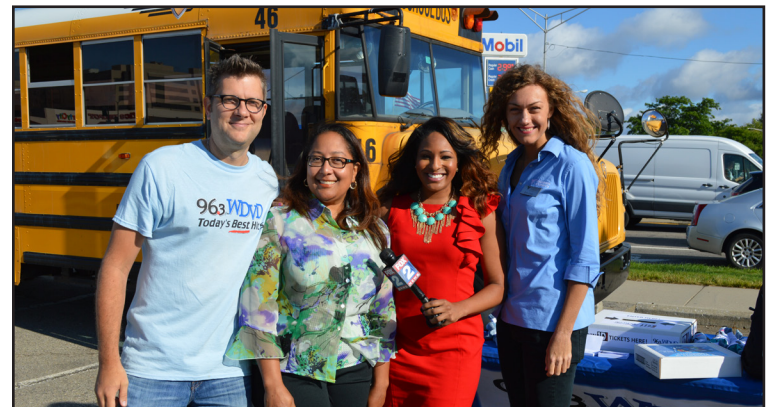
Bus stops here: Operation Backpack gets a boost every year from “Stuff a Bus” events with partners at WDVD and Fox 2.

DO GOOD, FEEL GOOD: FIND OUT ABOUT VOLUNTEER ACTIVITIES!