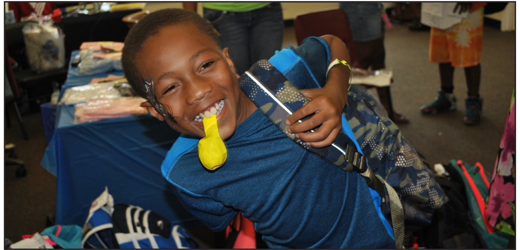
Backpack to school: A young student tries on a brand-new backpack loaded with supplies during a Volunteers of America open house event.

Faithful partners like Meadowbrook Insurance and Zeal Credit Union pitched in again, and we also loved seeing lots of new faces this year: J R Automation and AXA Advisors, as well as Life Church Canton stepped up to help out. Many more than we can thank here, but know we are grateful, and so are the students.